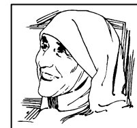
Blessed Mother Teresa