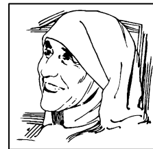
Blessed Mother Teresa