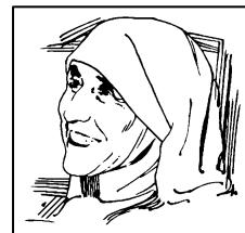
Blessed Mother Teresa

If you would like to nominate a young man or woman who is single and 15 years old or older and who you believe has the qualities needed in a future priest, sister, or brother, please use the ballot on the back. Ballots may be returned to the parish office or placed in the collection basket. Remember, promoting vocations is the responsibility of everyone. One person CAN make a difference!